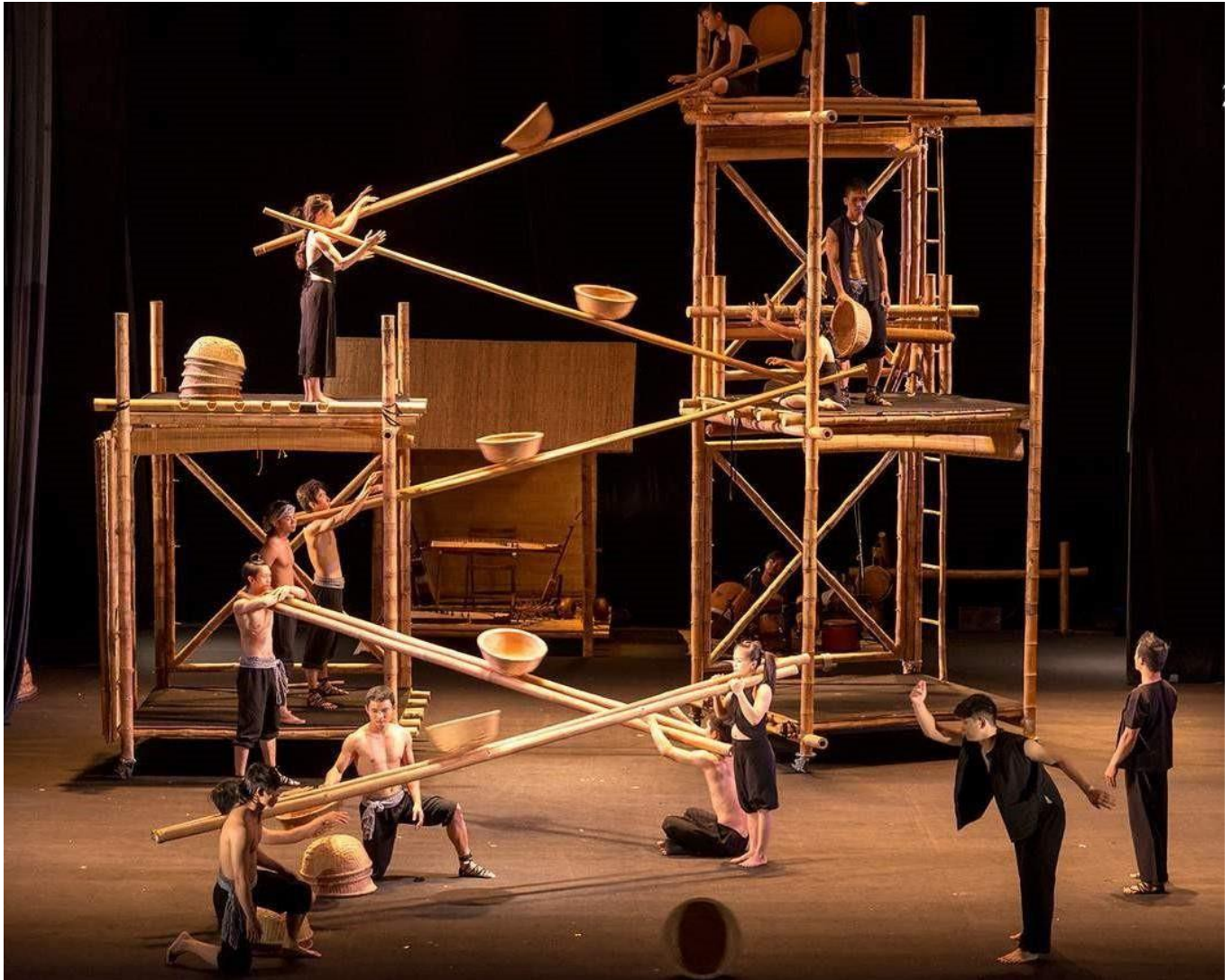
A O Show – Sai Gon

Price: Kindly contact us for more detail