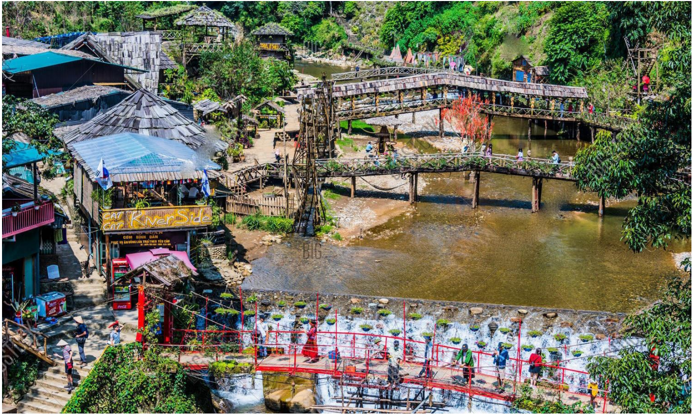
Cat Cat Village