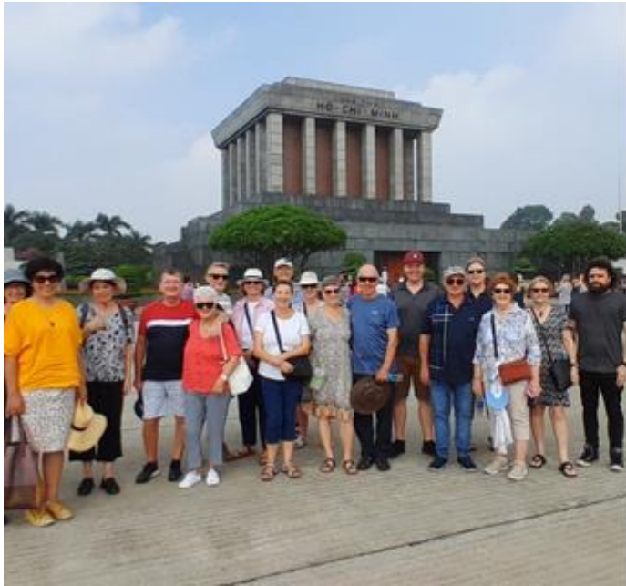
Ho Chi Minh Complex