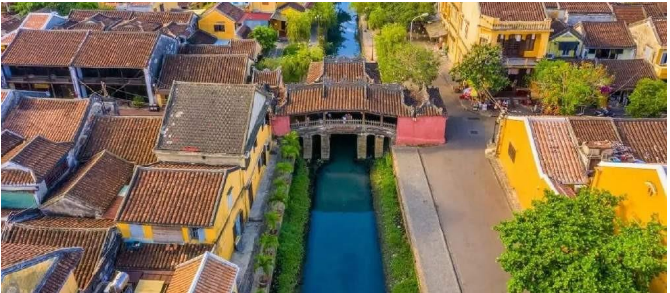
Japanese Covered Bridge Pagoda

At Leisure and then you will be taken to the airport in Nha Trang to take 1-hour flight to Da Nang City, where you will visit Marble Mountains en route to the charming Hoi An.