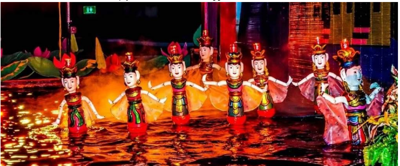
Water Puppet Show

Then, transfer back to Hanoi, enjoy Traditional Water Puppet Show