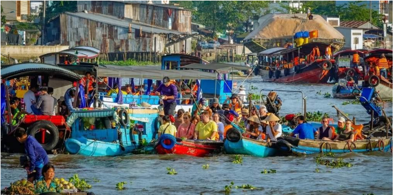
Cai Rang Market

The market is unique culture of local people living along this mighty river. Instead of shopping in the town, they shop and barter on the river that is more convenient to access by waterways.