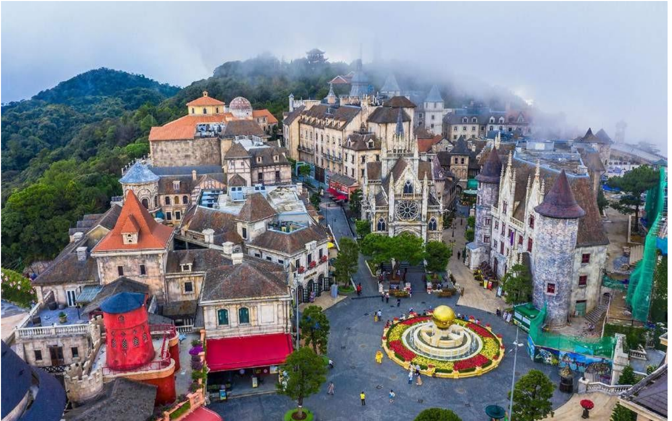
Ba Na Hills

Arrive at the cable car station Suoi Mo. Sitting in the cabin, in mid air, looking upon the endless tree lone of the forest. Experiencing the pristine ecological system of the Ba Na mountain will leave you a sense of unforeseeable discovery