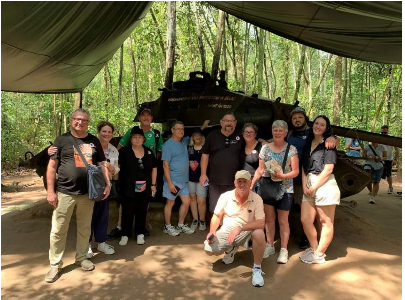
Cu Chi Tunnels

This morning we drive to Cao Dai Temples in Tay Ninh to observe the midday service. Near the Cambodian border, is home to the unique Cao Dai sect, whose patron saints include Joan of Arc, Victor Hugo and Winston Churchill to name a few. The trip to Tay Ninh is combined with a visit to the Cu Chi Tunnels ; the tunnel system stretched over 200km. The network included innumerable trap doors, specially constructed living areas, storage facilities, weapons factories, field hospitals, command centers and kitchens.