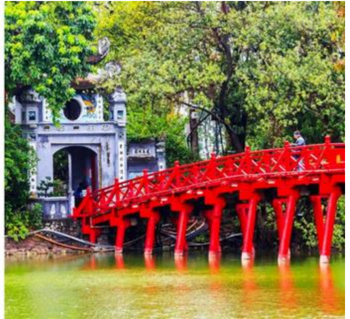
Ngoc Son Temple