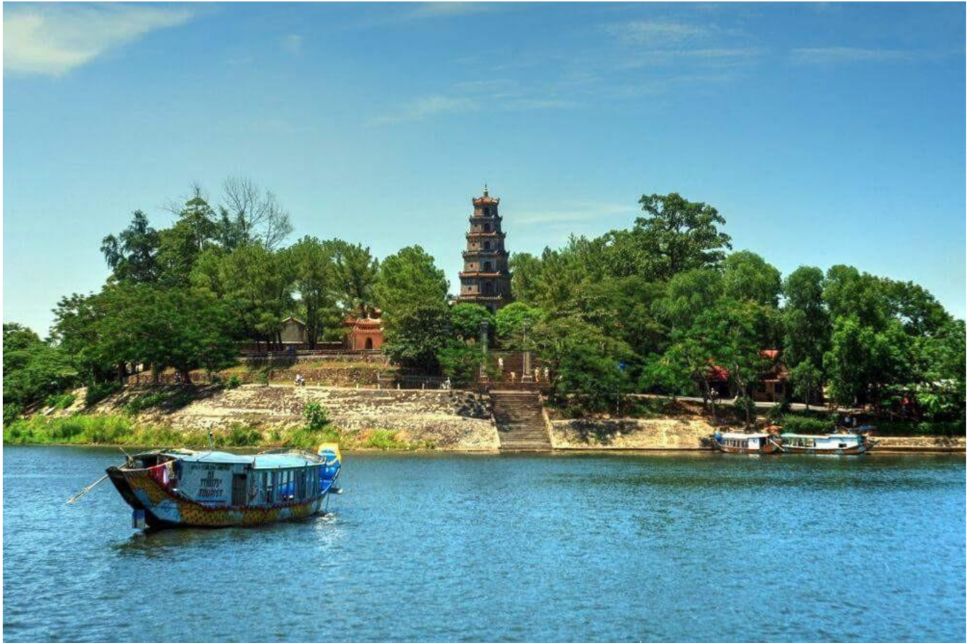
Thien Mu pagoda

Then, enjoy afternoon street food such as: “ Bun Bo Hue ”, “ Banh Nậm ”, “ Banh Khoai ”, “ Banh Beo ”, “ Nem Lui ” & “ Che Hem ”