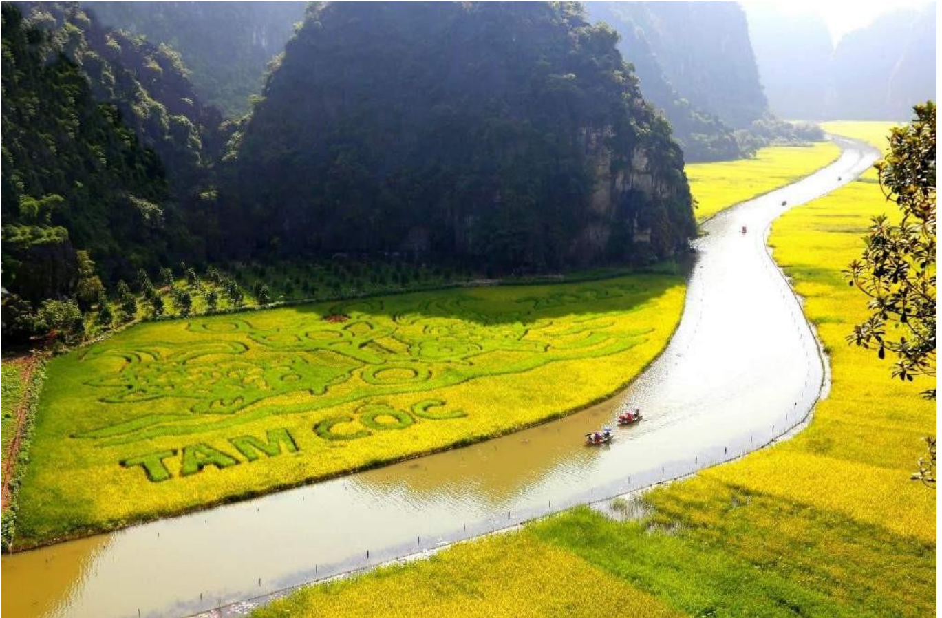
Trang An - Landscape Complex

Return to Hanoi in the late afternoon, have dinner at local restaurant, then transfer to Hanoi Railway Station for night train to Lao cai